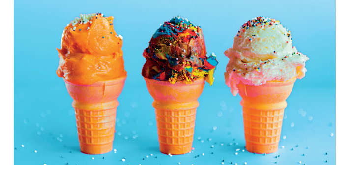
C Write an online comment about your favourite comfort food. Go to the Writing Bank.

Maybe noodles with chicken or your mother's home-made pierogi (filled dumplings), it depends where you are from. For many people around the world it's pizza and for a lot of us it's ice cream. What is your favourite comfort food? Write and tell us.